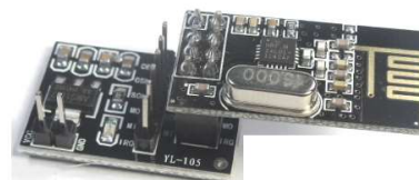
Nrf24L01 mounted in to adaptor