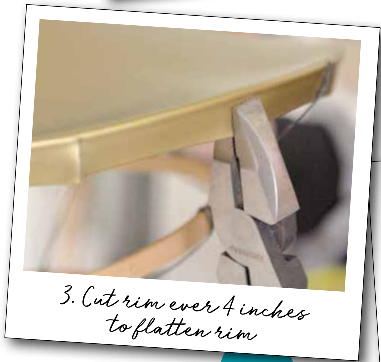
3. Cut rim ever 4 inches to flatten rim