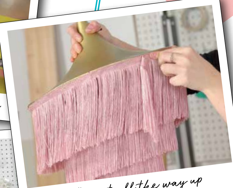
12. Repeat all the way up