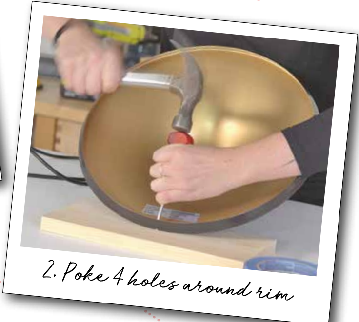
2. Poke 4 holes around rim