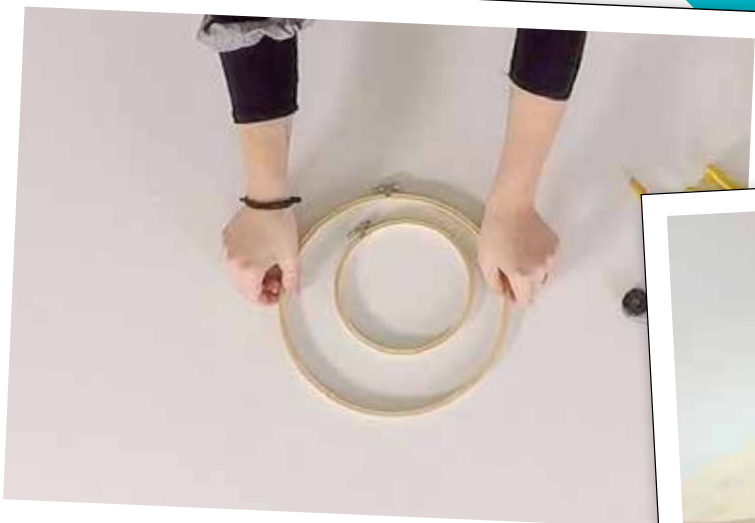
5. 2 Embroidery hoops, only inner hoops

8. Thread and tie twine to holes in lampshade