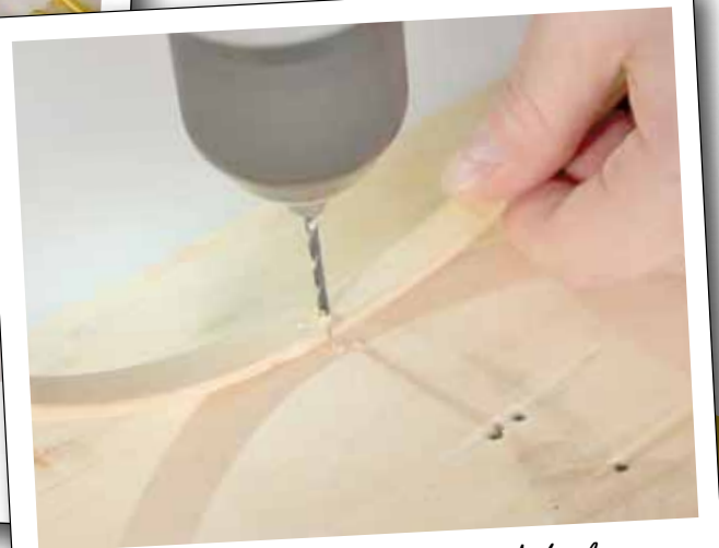
6. Drill 4 equal spaced holes