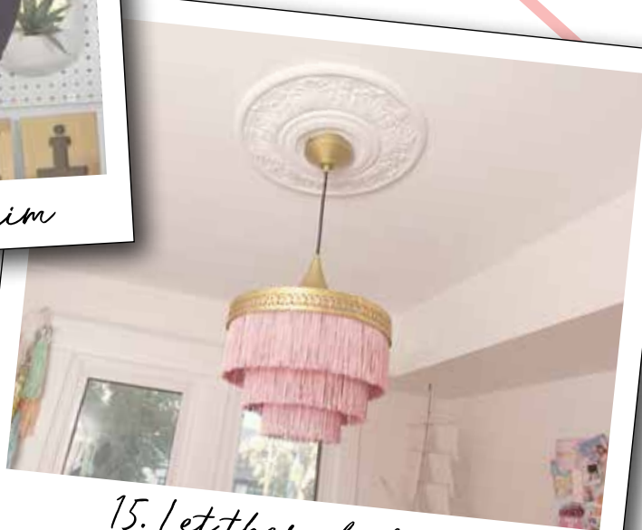
15. Let there be light!

Be sure to watch the Buy or DIY episode!