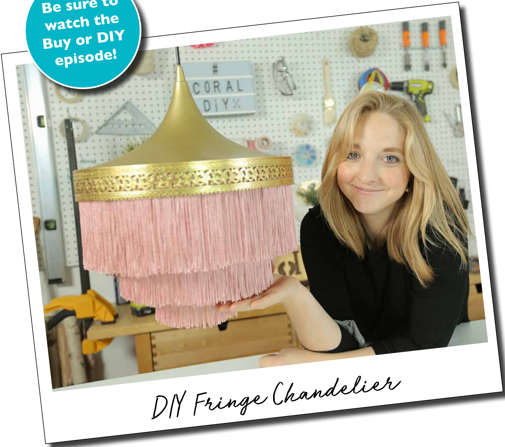
DIY Fringe Chandelier

Be sure to watch the Buy or DIY episode!