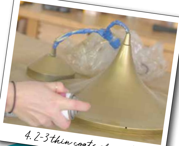
4. 2-3 thin coats of paint

6. Drill 4x equal spaced holes in the walls of each hoop using your thinnest bit