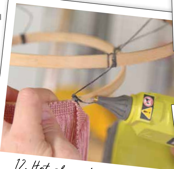
12. Hot glue chainette fringe