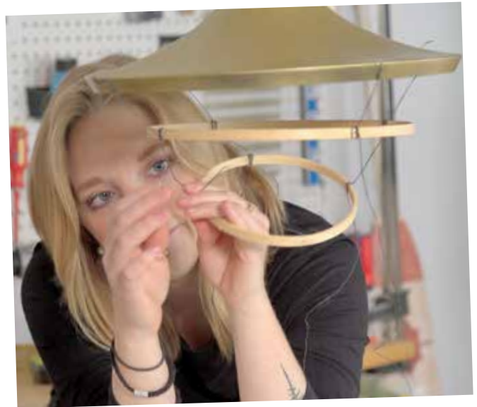
11. Repeat with smaller hoop