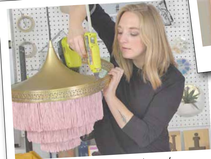
13. Hot glue decorative trim