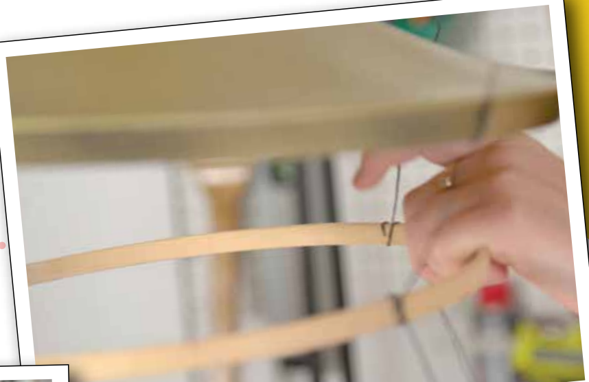
9. Thread bigger embroidery hoop onto twine