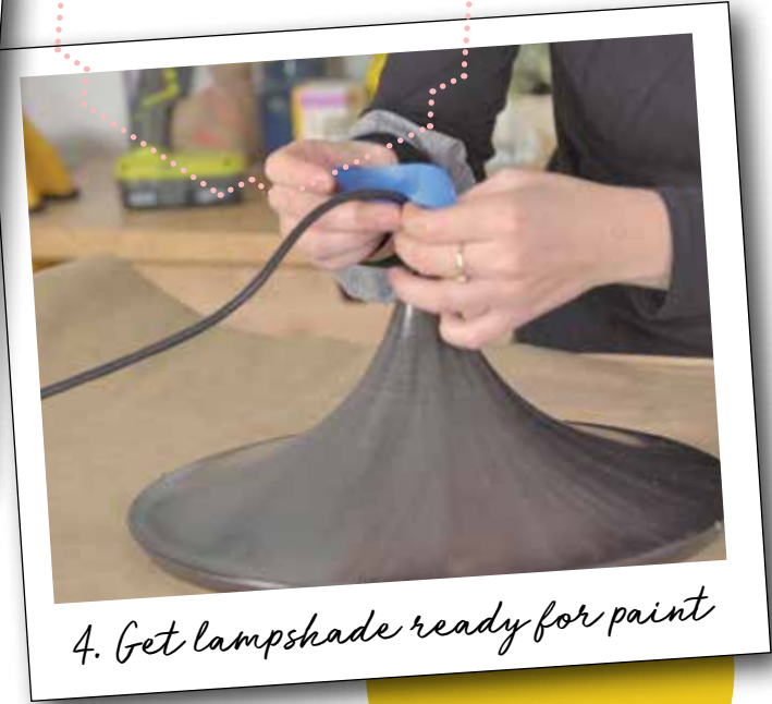
4. Get lampshade ready for paint