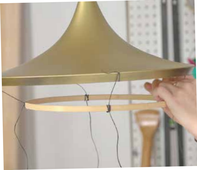
10. Adjust hoop until level, secure with knots

10. Adjust hoop until it's level and secure twine with knots