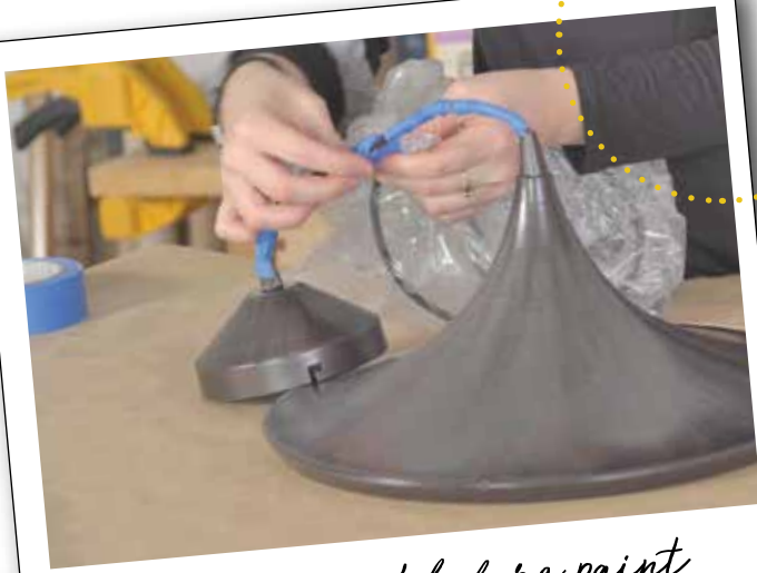
4. Cover cord before paint

5. Grab 2 embroidery hoops, you only need the inner hoops.