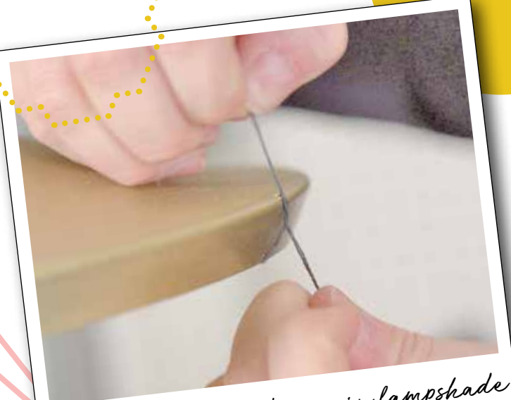
8. Thread and tie twine in lampshade