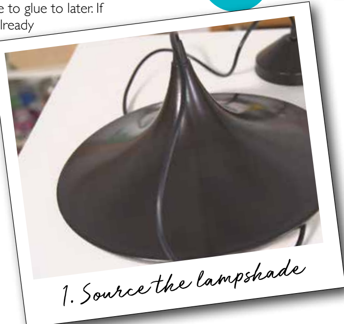
1. Source the lampshade