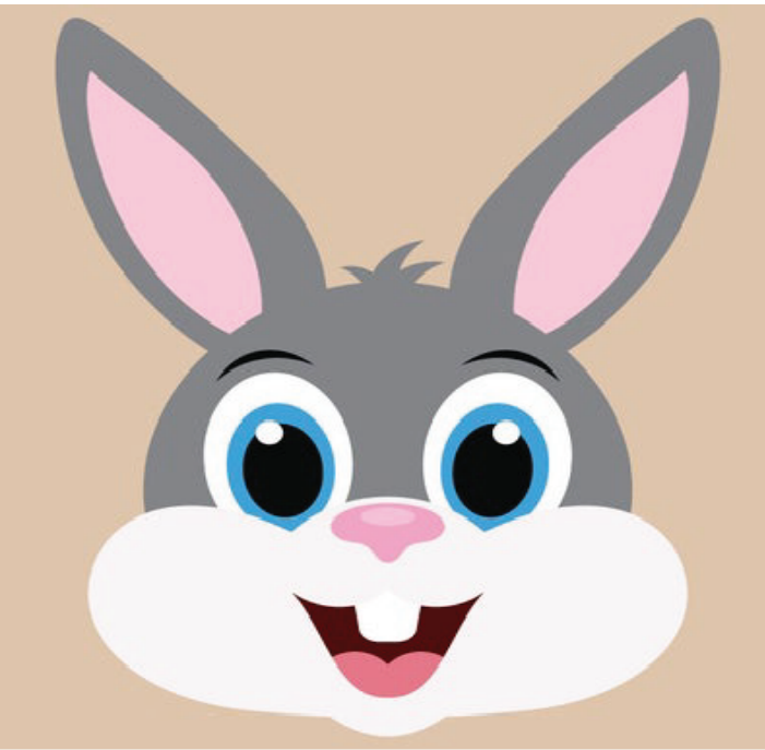
BUNNY BOT HEAD