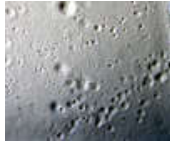
Your own terrestrial planet without atmosphere by AlphaRomeo