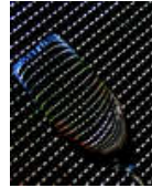
Learn Morse Code... by ScArE220CCCastil