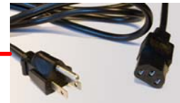
AC 110V power cord