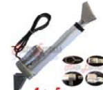
Linear Actuator 6 inch, 225 lb. 90 degrees forward rotation, then 90 degrees reverse.