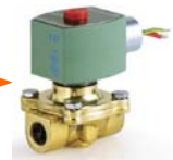
Solenoid for Trigger AC 110V 6.3W