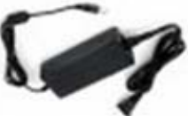
FP DC 12V 5A