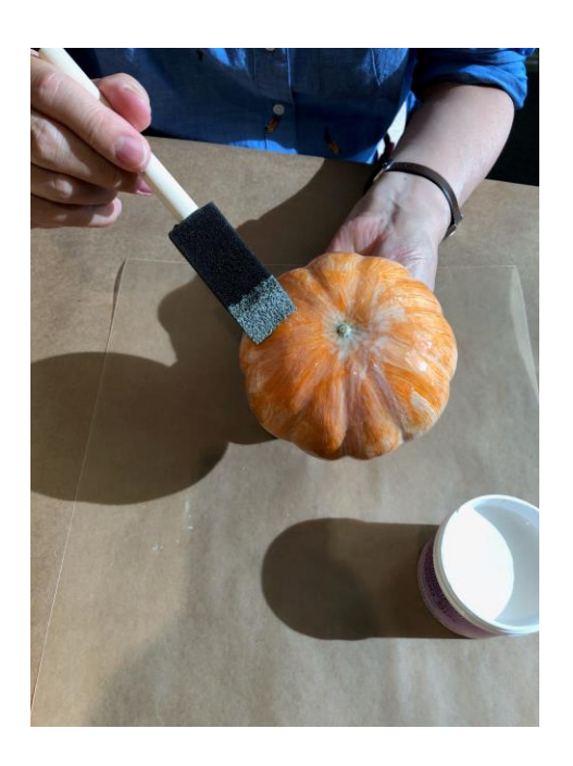
and turns clear as it reaches tack

Lightly load your foam brush and apply enough SGW Water-Based Size to leave a thin white coating all over the pumpkin. Rest the sized pumpkins on wax paper. The SGW Size will quickly shift from milky white to glossy and clear (in about 20 minutes), then the pumpkin is ready to gild. Check that the glue feels dry but tacky.