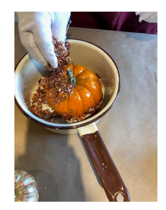
Swirl your pumpkin!