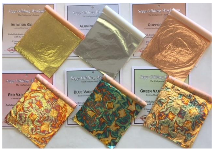
Sepp Gilding Workshop Leaf – Imitation Gold, Aluminum, Copper, and Red, Blue and Green Variegated