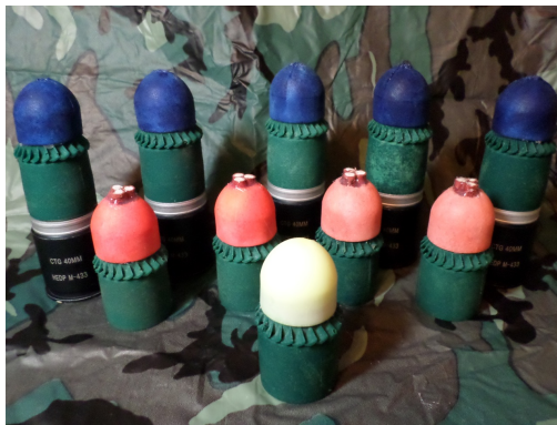
Figure 1. Chalk-filled projectiles (blue) and foam projectiles (yellow)

The P.M.O.G. Airsoft / paintball 40mm Projectiles is designed to be used in Airsoft and paintball gameplay as means to paint a target as being destroyed. The target can be a cover, bunker, vehicle, or group of players in a 10 feet / 3 meters radius.