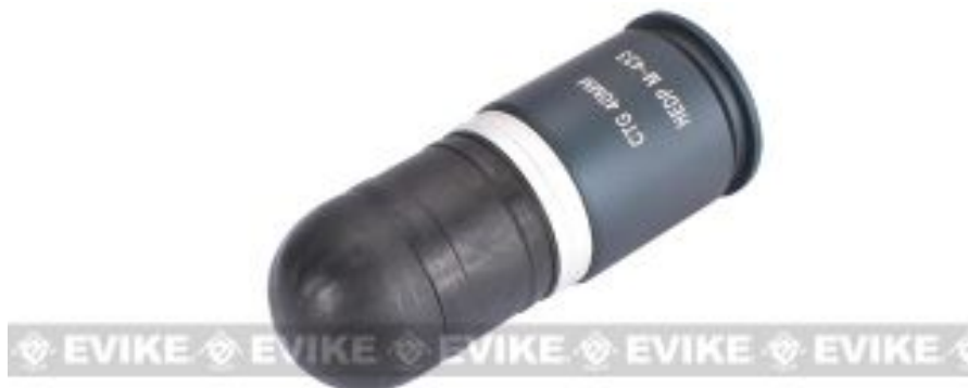
Figure 4. G&P 40mm Rubber Projectile Cap Type Airsoft Gas Grenade Shell