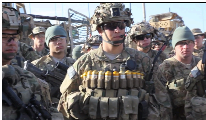
Figure 6. Tactical Taylor 40mm Belt worn at chest level