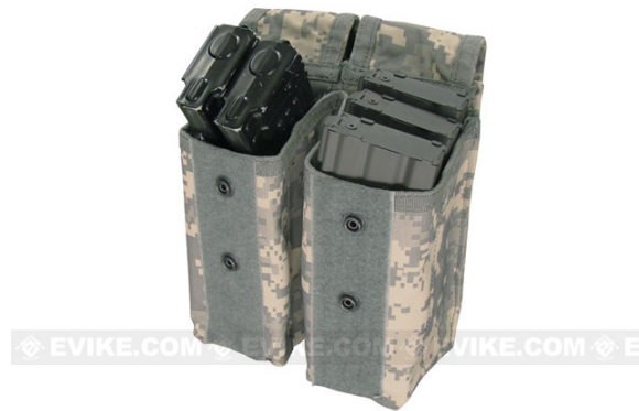
Figure 5. Condor Double AK Magazine Pouches.

P.M.O.G. Airsoft / paintball 40mm Projectiles feature frangible or spongy tips and hollow bodies, so they need protection during transportation. It is recommended to use a 1.5-inch PVC Schedule 40 pipe cut to 37-inch / 80-centermeter long to protect the projectiles. An AK magazine pouch can easily house two projectile / shell / protector combos (Figure 5). In addition, a Tactical Taylor 40mm Belt can carry the projectiles and shells and provides quick access to them. And if the users wear the belt at their chest level, the chances of falling upon the projectiles and damaging them are quite low (Figure 6).