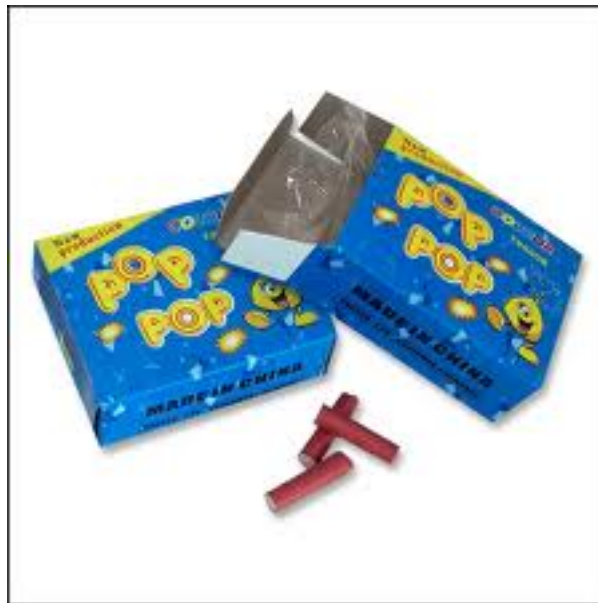
Figure 2. Snapper (a.k.a. Pop-pop, Mandarin Snaps, Adult Snaps, and etc)