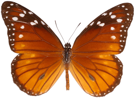
DANAUS ERESIMUS Tropical queen America