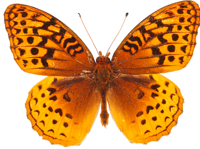
SPEYERIA CYBELE Great spangled fritillary America