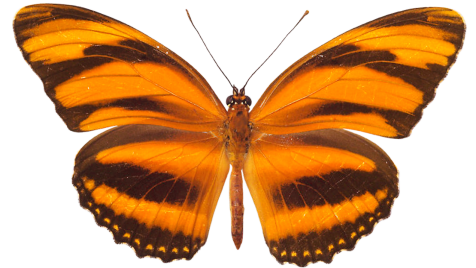
DRYADULA PHAETUSA Orange tiger Brazil