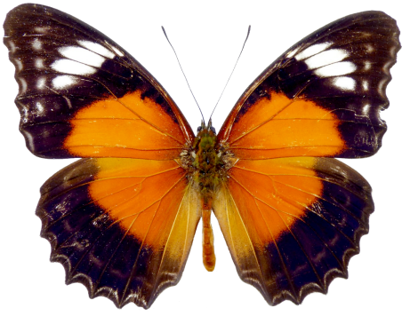
HYPOLIMINAS MISIPPUS Danaid eggfly Australia