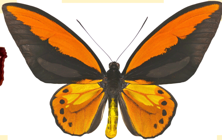
ORNITHOPTERA CROESUS LYDIUS Orange birdwing Papua New Guinea