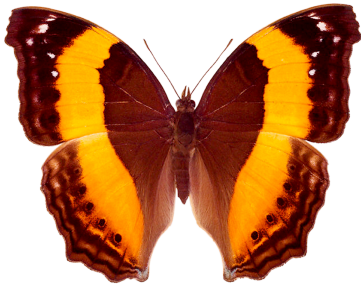
YOMA SABINA Australian lurcher Australia