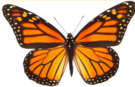
DANAUS PLEXIPPUS Monarch butterfly Britain