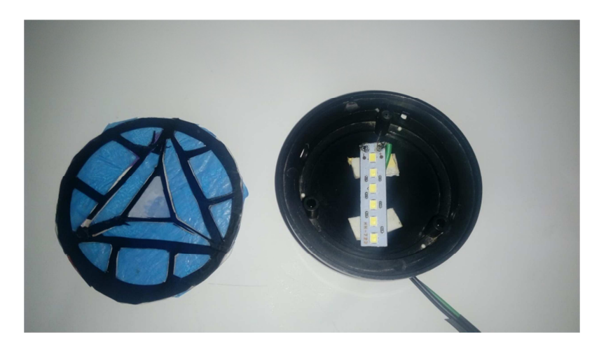
Stick it to the case as per the picture by using glue gun