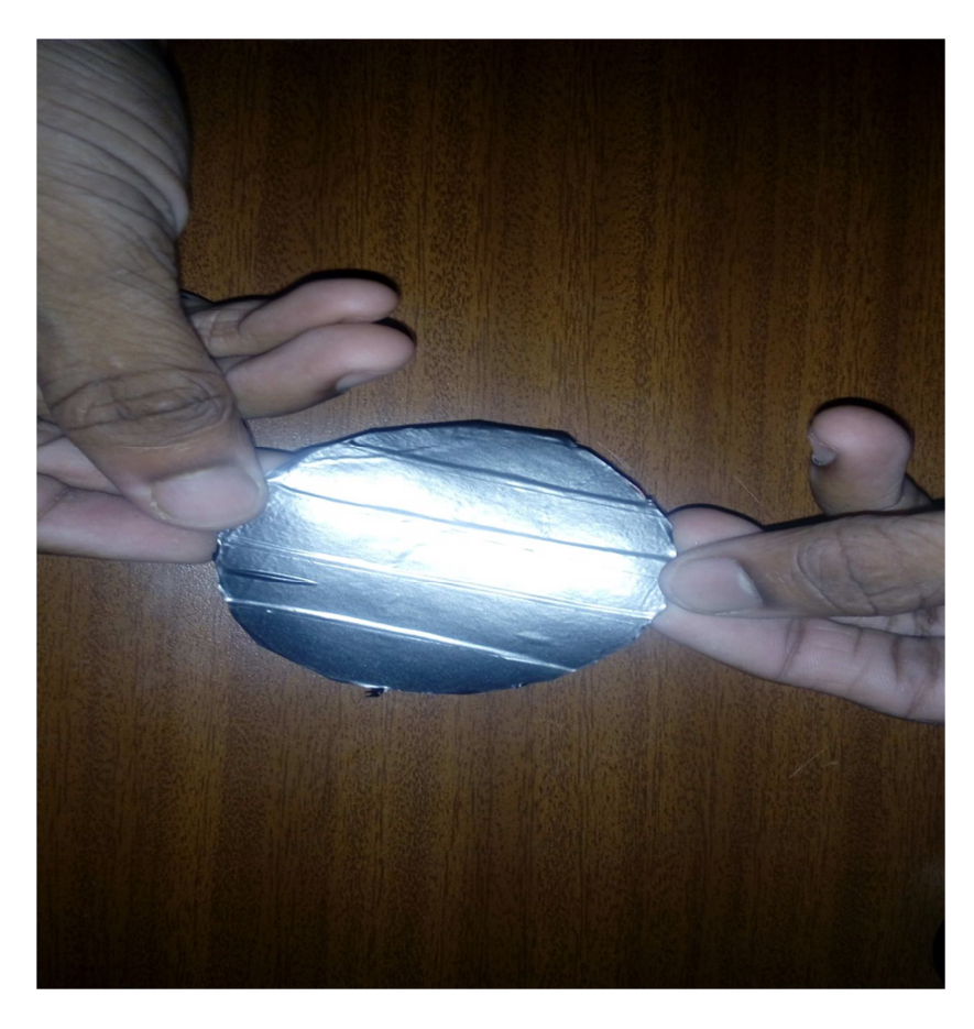
As per the lines drawn on the paper cut it with a pen knife