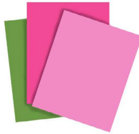
Coloured card (All sorts of colours)