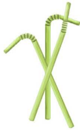
Straws (Preferably green)