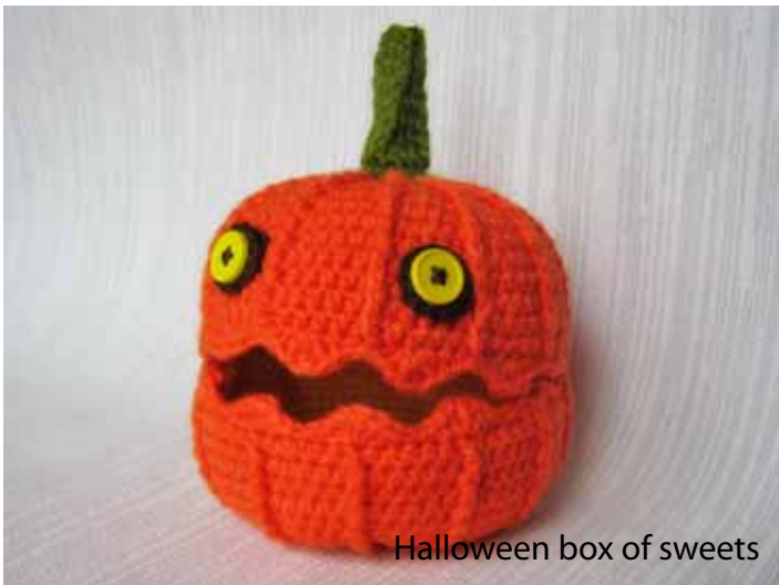
Halloween box of sweets