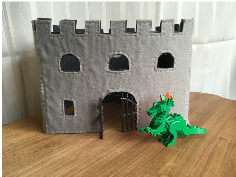
Once upon a time there was a dragon who lived in a castle.

After swimming, it was time to read a book.