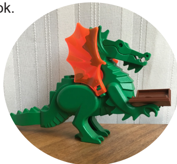
After reading, it was time for lunch.

After swimming, it was time to read a book.